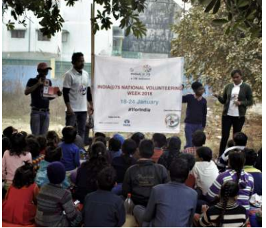
Nirbhed Foundation organized a session on digital literacy in a slum in Delhi to sensitize the slum dwellers, especially the youth & children, about the usage & importance of smartphones, laptops and other devices.