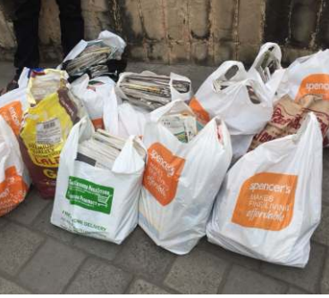
Students of St. Xavier's College colelcted as many books as possible for underprivileged children to raise the general awareness about the several million children who do not have access to schools. They collected over a 1000 books as a part of this campaign.